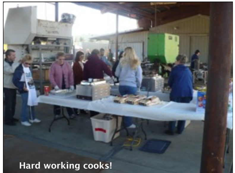
Hard working cooks!