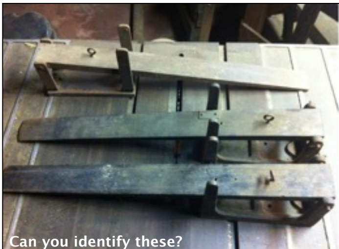
Can you identify these?