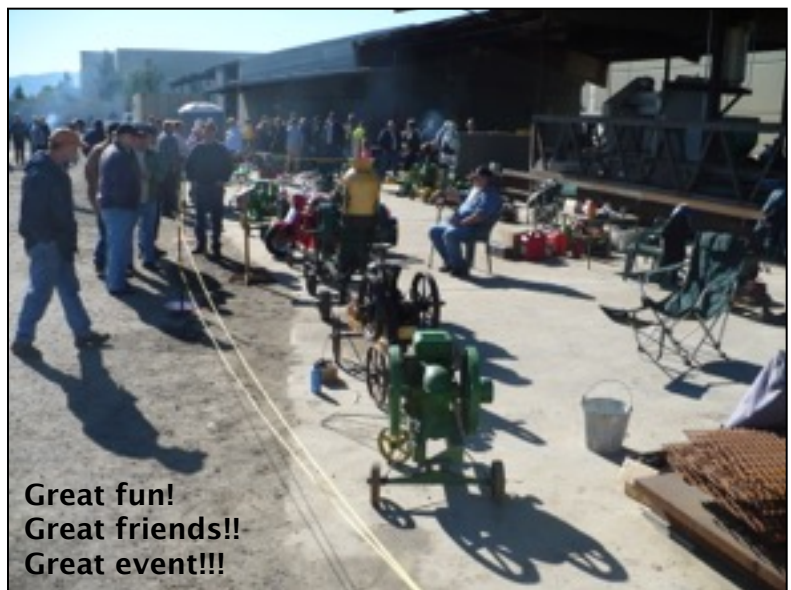
Great fun! Great friends!! Great event!!!