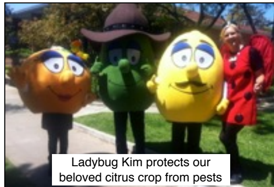
Ladybug Kim protects our beloved citrus crop from pests