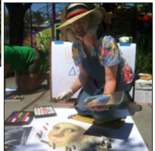
Artists from the Warren High School and the La Habra Art Museum demonstrate their skill with chalk on paper

Be prepared in an emergency. When your engine is running stay close by. Inform others how to stop your engine if necessary. There was a runaway engine at the airshow. If the person had not been close by it could have been disastrous.