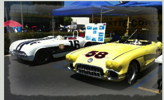
Corvette pace cars

If we have the opportunity to attend this show in the future, you don't want to miss it.