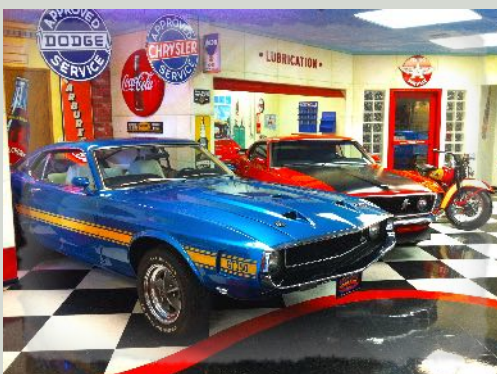
A section of the Surf City Garage set up like an old filling station