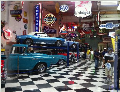
GM section of the Surf City Garage

This was the second year for the Surf City car show, and the first year that WAPA was in attendance. The event is hosted by Corvette Super Sports and the Surf City Garage.