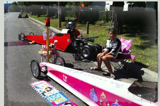
This young lady has been racing dragsters for six of her fourteen years.