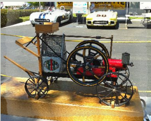
Dan Kato's International model