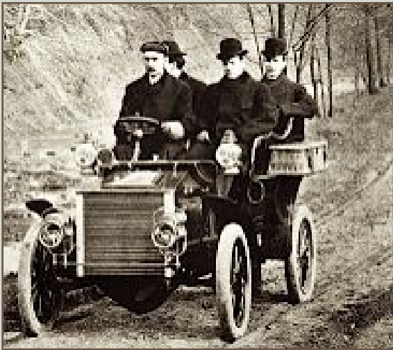
1903 White steam carriage

anywhere near its ultimate strength under ordinary operating conditions. The high working pressure gives great power to the engine and explains the success of the White automobile when climbing steep