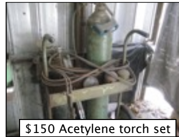
$150 Acetylene torch set