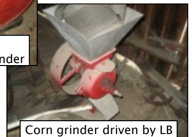
Corn grinder driven by LB