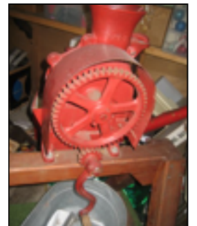
$75 Hand corn grinder on dolly (nice)

BOB SWAN COLLECTION SALE DATE: SUNDAY, SEPTEMBER 8, 2013 from 9:00AM to 2:00PM All items are stored at 10106 Mills Ave., Whittier, CA. No parking on Mills Ave. Park on side streets. Loading machines only in driveway.