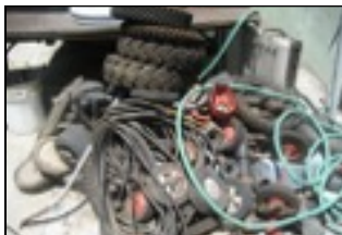
$50 Assorted wheels and tires