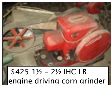
$425 1 1/2 - 2 1/2 IHC LB engine driving corn grinder

BOB SWAN COLLECTION SALE DATE: SUNDAY, SEPTEMBER 8, 2013 from 9:00AM to 2:00PM All items are stored at 10106 Mills Ave., Whittier, CA. No parking on Mills Ave. Park on side streets. Loading machines only in driveway.