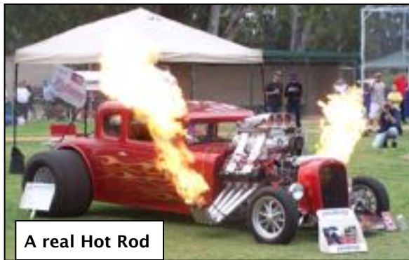
A real Hot Rod

The forecast for Saturday, June 7 called for 100+ degrees. You would think this would discourage many WAPA members from attending but it didn't. We had 22 members showing engines and motorcycles.