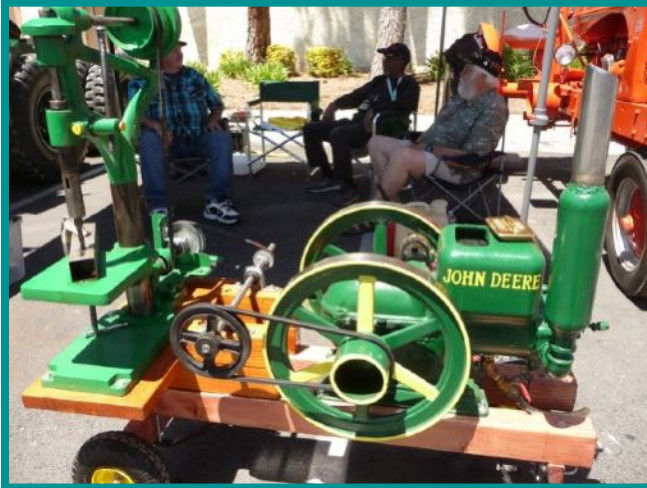
Chino Corn Feed Run