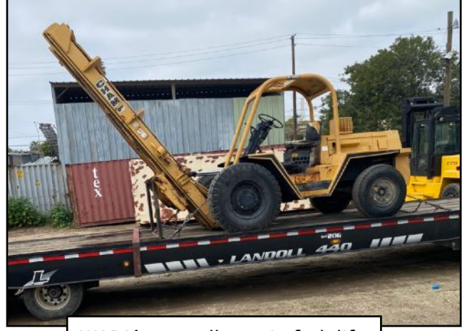
WAPA's new all terrain fork lift.

It was back to Ron's to pull the flywheel and the side plate. All the parts were inside but found the pin to push the governor weights was broken. Luckily Ron had one so with a little assembly the engine was back together. The engine is now ready to take back to him when I leave in May.