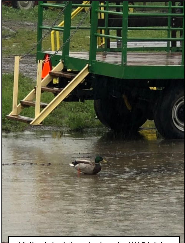
Mallard duck is enjoying the WAPA lake in the rain.